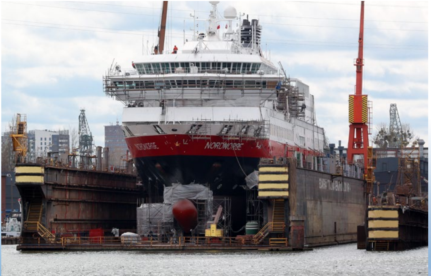
The Nordnorge lifted in the dock no 4 with a new bulbous bow integrated into the hull